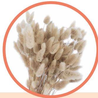
BLEACHED NATURAL BUNNY TAIL