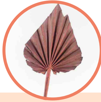
BROWN PALM SPEAR