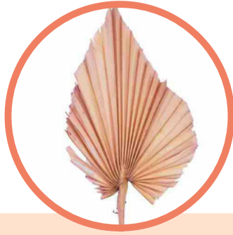
LIGHT PINK PALM SPEAR