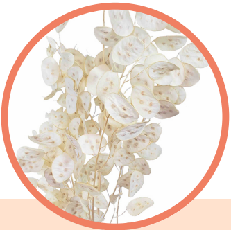
BLEACHED WHITE LUNARIA