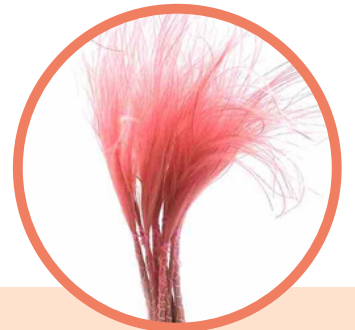
LIGHT PINK STIPA TROLL GRASS