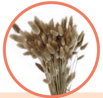
BROWN BUNNY TAIL