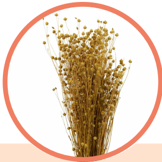
NATURAL FLAX GRASS