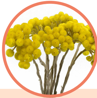
HELICHRYSUM EVERLAST YELLOW