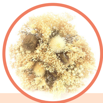
PRESERVED BOUQUET FANTASY NATURAL