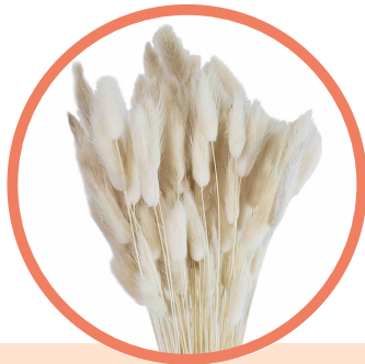
BLEACHED WHITE BUNNY TAIL