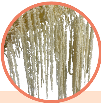
DARK BLUE HANGING AMARANTHUS