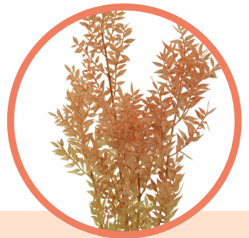
PEACH ITALIAN RUSCUS