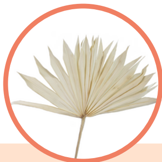
BLEACHED WHITE PALM