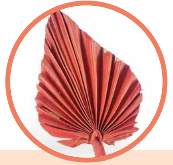
RED PALM SPEAR