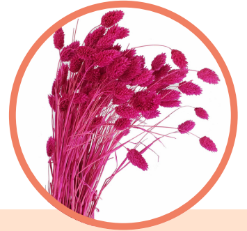
HOT PINK PHALARIS