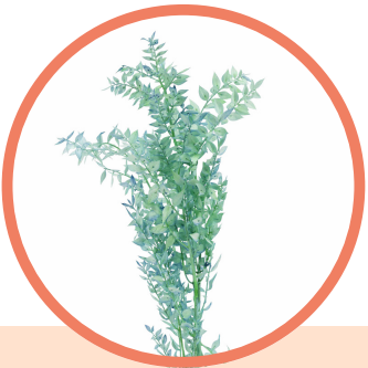
TEAL ITALIAN RUSCUS