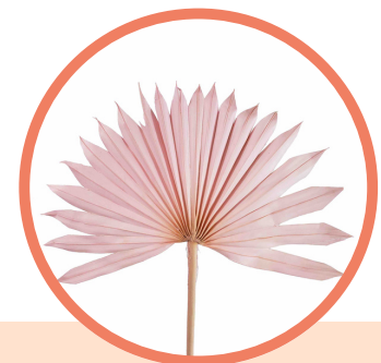
LIGHT PINK PALM