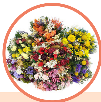
PRESERVED BOUQUET FANTASY ASSORTED