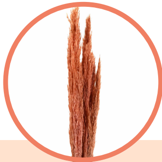
PEACH PAMPAS GRASS