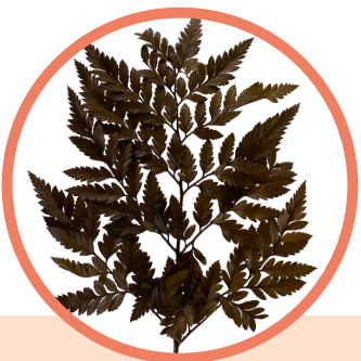
BROWN LEATHER FERN