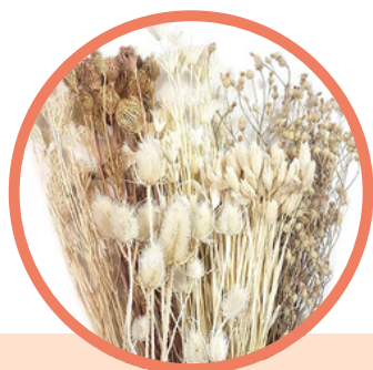
PRESERVED SUPER MIX TOKYO ASSORTED

If you enjoyed this guide, then be sure to check out our Flower Library, which includes over 385 dried & preserved products! The library is filled with colorful pictures, availability by date, month or season, and a way to submit a quote to your local Mayesh.