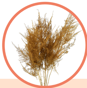
TINTED BRONZE PLUMOSA