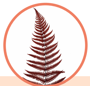
BROWN PARCHMENT FERN