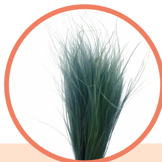
TEAL TROLL GRASS