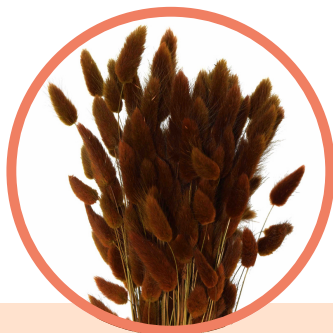
BROWN BUNNY TAIL