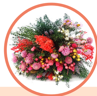
PRESERVED BOUQUET FANTASY PINK