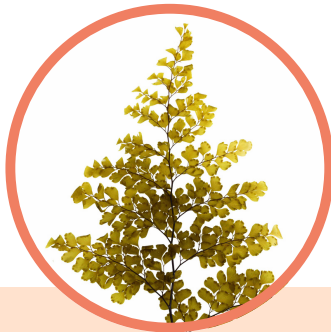
MAIDEN HAIR FERN