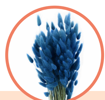
BLUE BUNNY TAIL