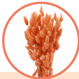
PEACH BUNNY TAIL