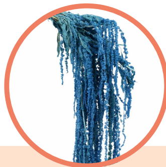
LIGHT BLUE HANGING AMARANTHUS