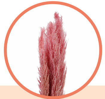
LIGHT PINK PAMPAS GRASS