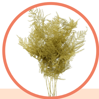
TINTED GOLD PLUMOSA