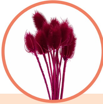
DARK PINK ERYNGIUM