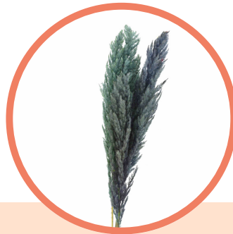
BLUE PAMPAS GRASS