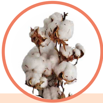
COTTON ON A STICK