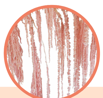
LIGHT PINK HANGING AMARANTHUS