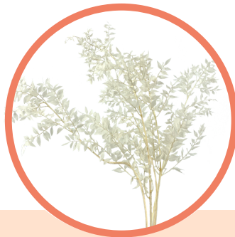
BLEACHED WHITE ITALIAN RUSCUS