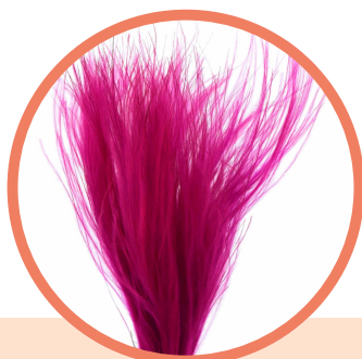
HOT PINK TROLL GRASS