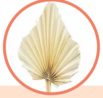
WHITE PALM SPEAR