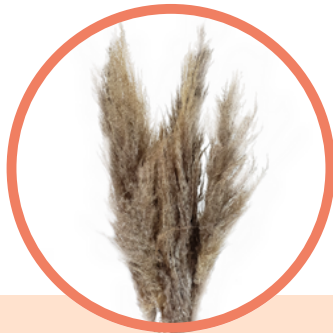
BROWN PAMPAS GRASS