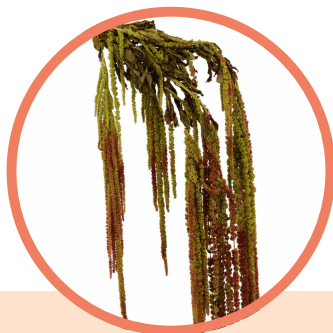
BI-COLOR HANGING AMARANTHUS