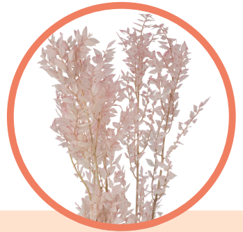
LIGHT PINK ITALIAN RUSCUS