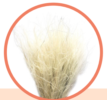
NATURAL TROLL GRASS