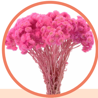
HELICHRYSUM EVERLAST PINK