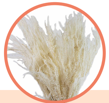
WHITE HELECHO FERN