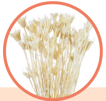
BLEACHED WHITE NIGELLA