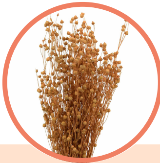
PEACH FLAX GRASS