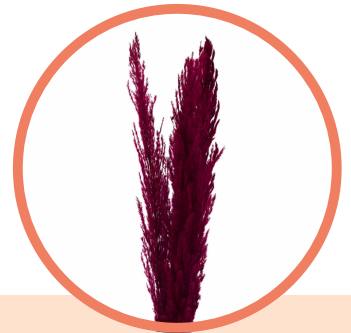
BURGUNDY PAMPAS GRASS