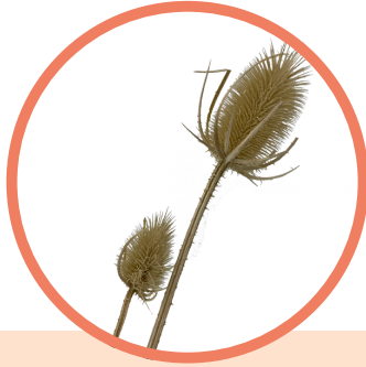
BLEACHED WHITE ERYNGIUM