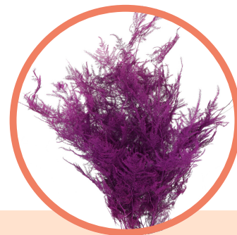
TINTED PURPLE PLUMOSA