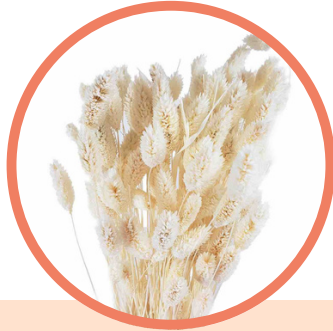
BLEACHED WHITE PHALARIS