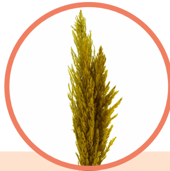
LIGHT GREEN PAMPAS GRASS