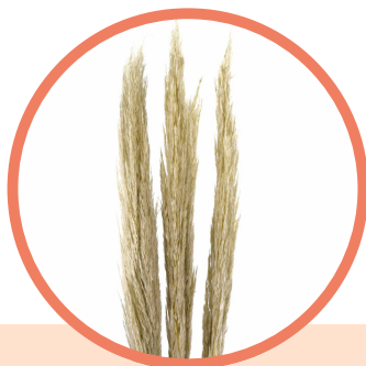
NATURAL PAMPAS GRASS