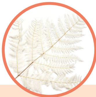
WHITE LEATHER FERN